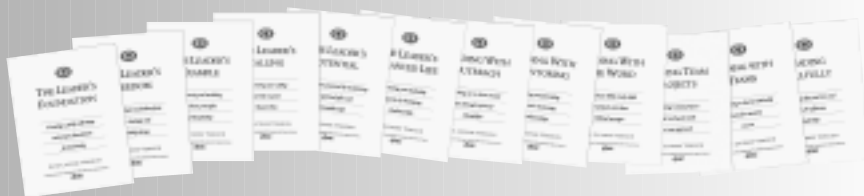
FEL Series: Site License Version

We have created a sample CD for each version to allow you to have a sample of each of the 12 modules and answer Frequently Asked Questions. Call the LTI office to receive a copy at 757-673-6581.