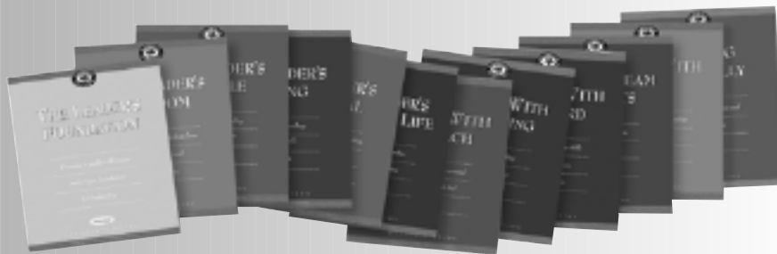
FEL Series: Standard Version

We raised 96% of the project funds! The project costs rose to a total of $575,000 and we have raised $550,000 to date! We are so thankful to everyone who gave toward this effort. Thank you! Your giving will literally touch the world.