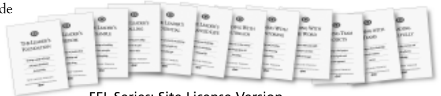
FEL Series: Site License Version

We have raised $505,000 of the $550,000 needed to complete the project, which is over 92%! We need only $45,000 more to complete the work by year end. Would you help us complete this task, so that we may see national renewal and worldwide harvest? Please send a gift today so that we may complete the wall!