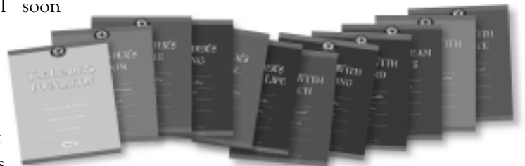
FEL Series: Standard Version

We are on the eve of completing the six-year effort to construct the FEL Series! All 12 modules will soon be available in the Standard Version for domestic use and the Site License Version for overseas use. Next year, we will focus our effort on national and worldwide distribution and leadership training events.