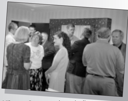
Milestone Party attendees mingling

LTI celebrated a great milestone at the end of August – we have completed ten of the FEL modules! The vision and dream of producing a world-class leadership training system is coming to pass! We held a milestone party for all the people who have worked hard over the past four years to bring the FEL Training Series into being. Many great testimonies were shared concerning the Lord's supernatural revelation, breakthroughs, and provision to create these materials for worldwide impact.