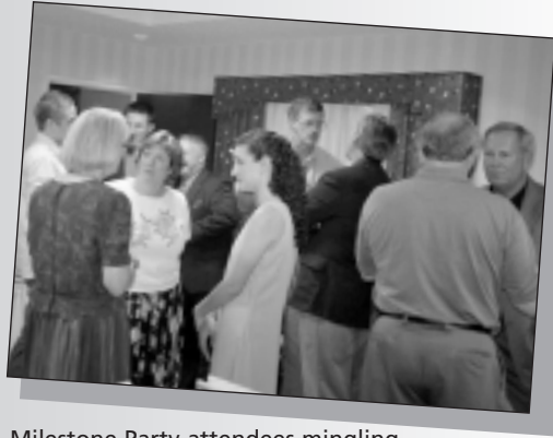
Milestone Party attendees mingling

LTI celebrated a great milestone at the end of August – we have completed ten of the FEL modules! The vision and dream of producing a world-class leadership training system is coming to pass! We held a milestone party for all the people who have worked hard over the past four years to bring the FEL Training Series into being. Many great testimonies were shared concerning the Lord's supernatural revelation, breakthroughs, and provision to create these materials for worldwide impact.