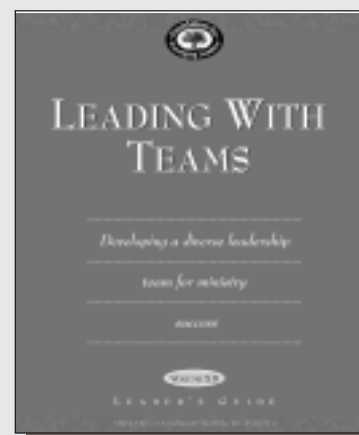
Leading With Teams

The Leading With Teams module is available for purchase now!