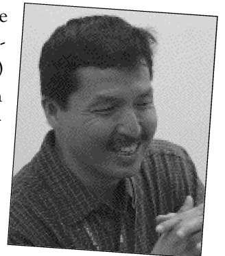
CNL Director of Training & Church Planting for Nepal

LTI has established a strategic partnership in the nation of Singapore, which is considered the gateway for all of Asia. Center of New Life (CNL) Church is launching a leadership institute within their church using LTI's Foundations for Emerging Leaders Series , and has also committed to serve as a demonstration site for other interested Asian churches and ministries.