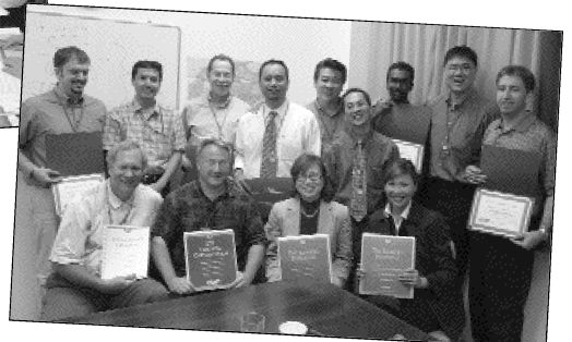
Certified Trainer Graduates

CNL is already helping LTI multiply the use of the FEL Series into other nations. CNL